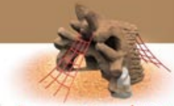
Sequoia Ground Web

Please see spec sheets for full specifications.