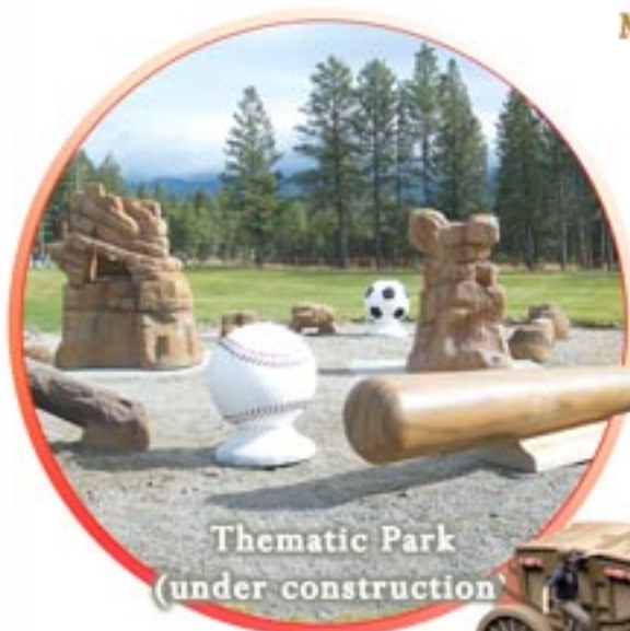
Thematic Park (under construction)