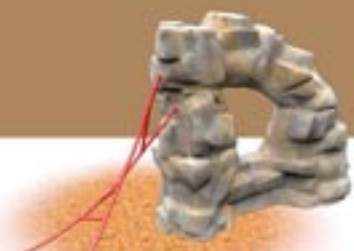
Diagonal Helix Climber