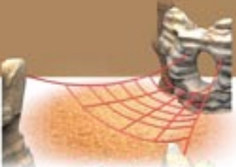
Inca Jungle Net