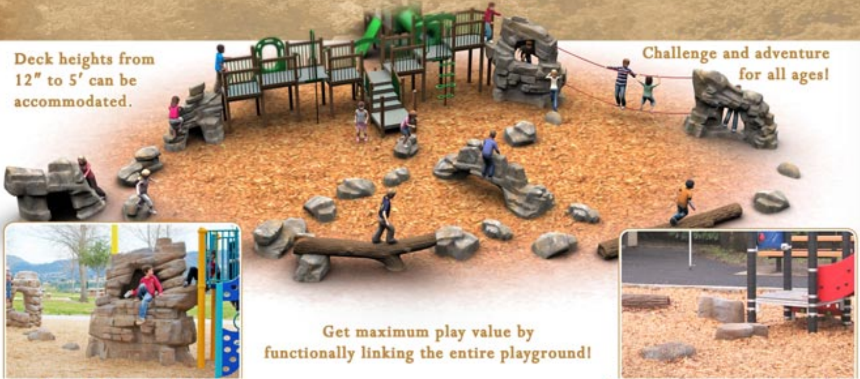
Monoliths go to decks

Get maximum play value by functionally linking the entire playground!