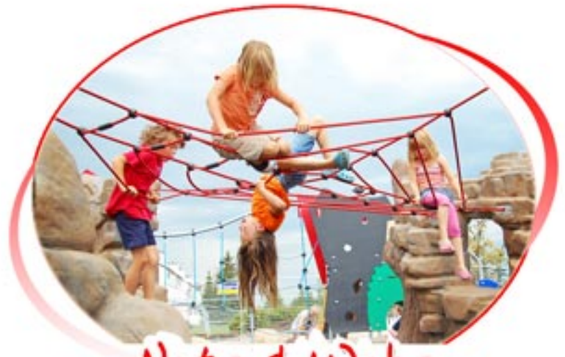
Nets & Webs