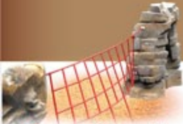
Burmese Tiger Net