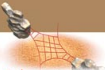
Spider Monkey Web